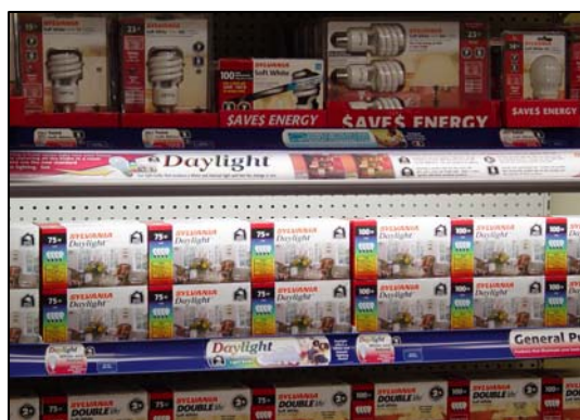
Illuminator with 2.5" Backlit Graphics Channel

This retail-tested lighting system attaches to the shelf- edge of almost any standard metal gondola shelf without tools and provides easy access to change bulbs or replace light fittings to keep installation and maintenance costs in check.