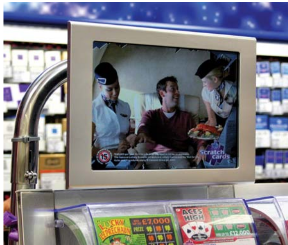
Camelot™, the UK National Lottery, Tesco installation; 1470 screens managed securely over the worldwide web

The most stable, simple, scalable & cost effective digital signage network management available today from Fastrak Retail